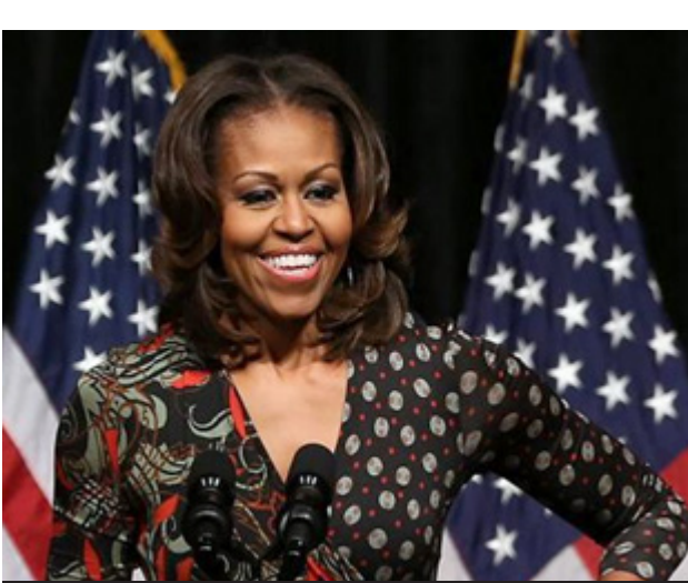
First Lady Michelle Obama

Through a contract with Commuter Advertising, based in Dayton, Ohio, Omnitrans buses play short audio advertisements which can be delivered at specified times or locations. For example, a restaurant could advertise a breakfast special between 6 and 8 a.m., or a book store could let passengers