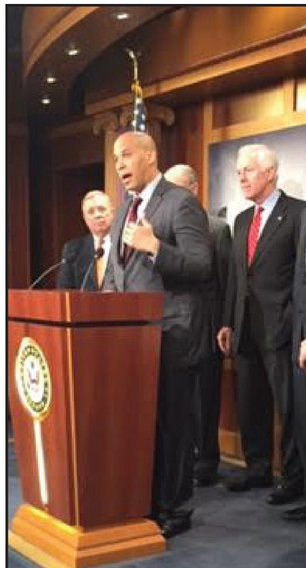
Senator Cory Booker (D-New Jersey).

Several relevant bills enjoy broad bipartisan